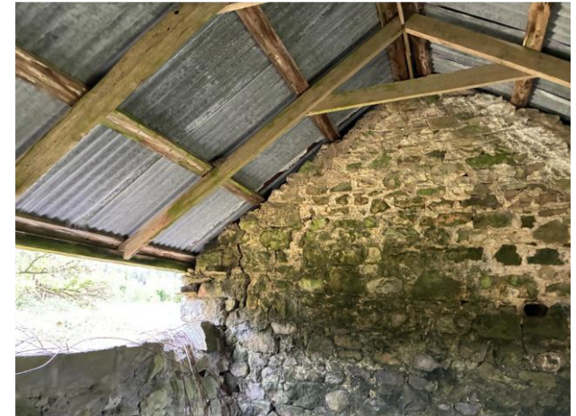
Plate 18: Internal view of Structure S6