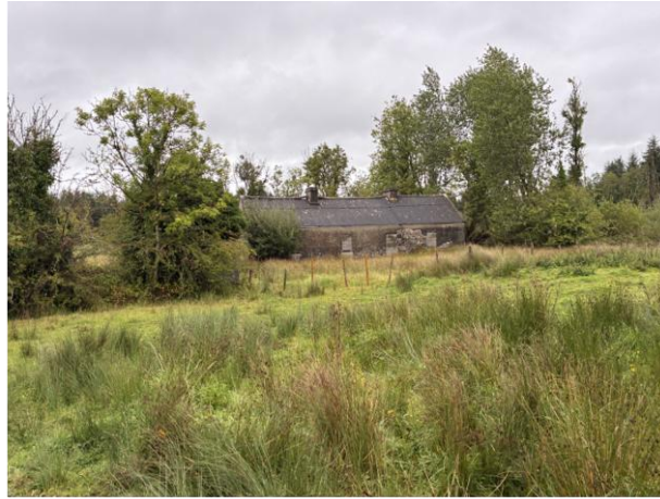
Plate 14: View of southern elevation of Structure S5