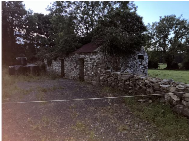
Plate 13: View of Structure S4