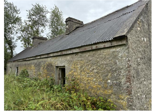
Plate 15: View of rear northern elevation of Structure S5