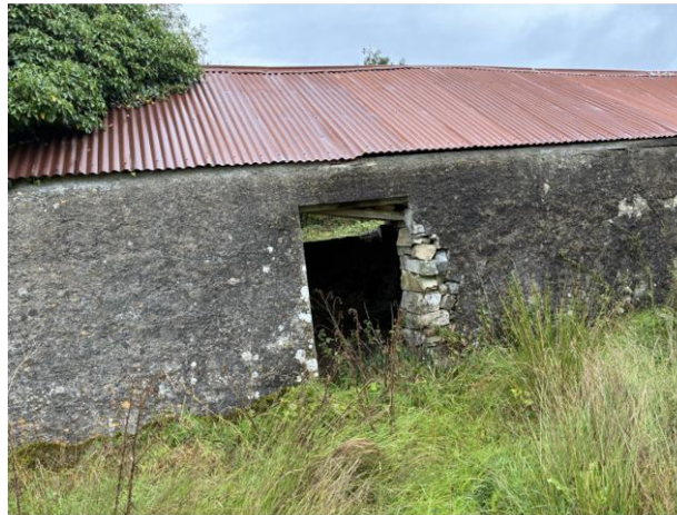
Plate 17: View of Structure S6 Eastern Elevation