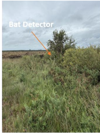
Plate 7: View of Bat Detector mounted on pole attached to tree at T9 location