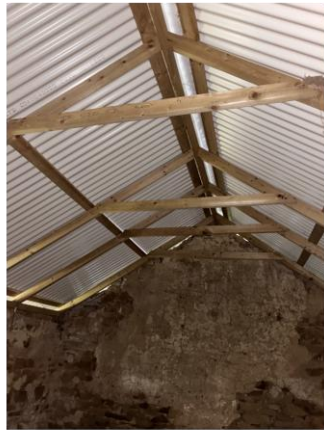
Plate 10: Internal view of Structure S1