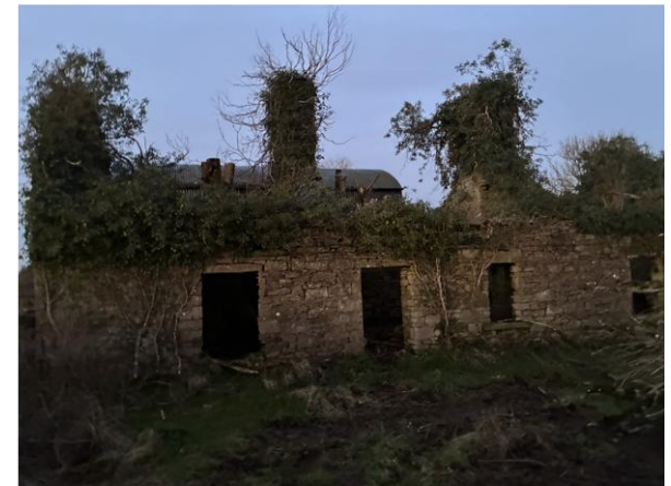
Plate 12: View of Structure S3