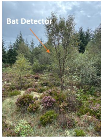
Plate 8: View of Bat Detector mounted on pole attached to tree at T11 location