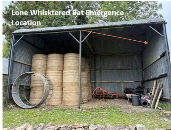
Plate 11: View of Structure S2