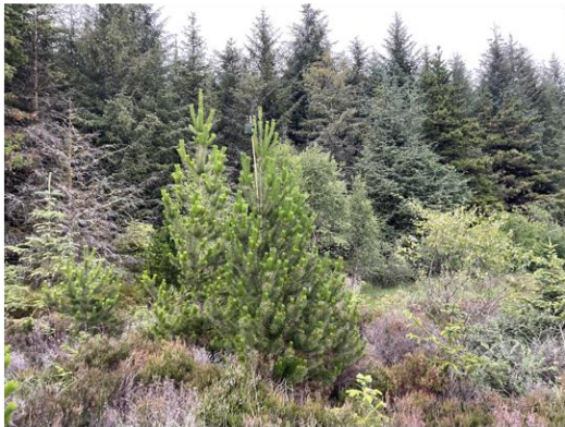
Plate 1: View of Bat Detector mounted on pole attached to tree at T5 location