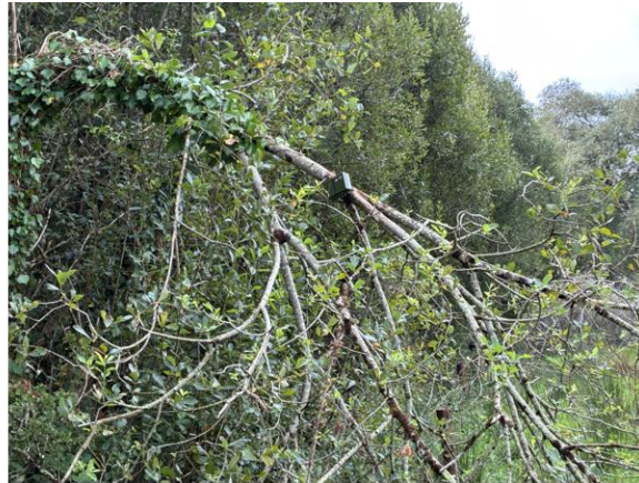
Plate 2: View of Bat Detector mounted on limb of tree adjacent to the T2 location