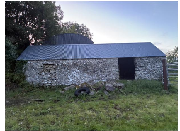
Plate 9: View of Structure S1 southeast elevation