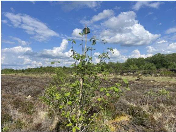
Plate 1: View of Bat Detector mounted on pole attached to tree at T1 location