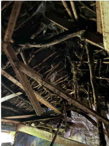
Plate 16: Internal view of dilapidated roof of Structure S5