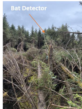
Plate 5: View of Bat Detector mounted on tree adjacent to the T7 location